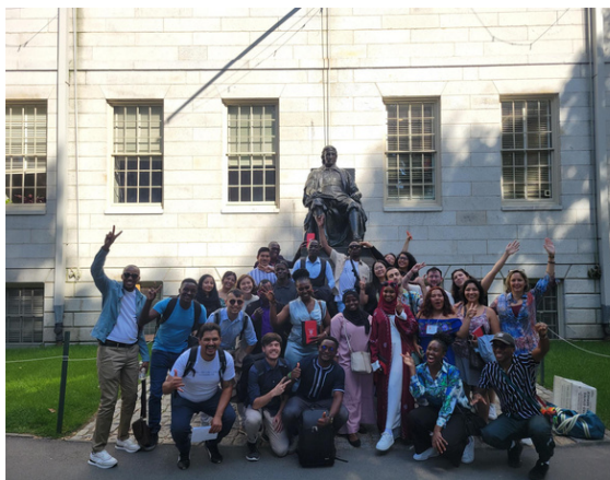
Next Generation Leaders alumni, Harvard University

Their recommendations for transforming institutions of higher education reached more than 1,400 participants in 53 countries around the world. The 2023 For Youth, By Youth planning grant from the Mastercard Foundation is a response to their request to create a sustainable, youth-led movement with expanded reach and impact. The grant supports a sequence of activities – including the August workshop and conference – that will lead to the development of a proposal for a multi-year initiative that is conceptualized and operationalized for youth, by youth. The Next Generation Leaders are leading the way.