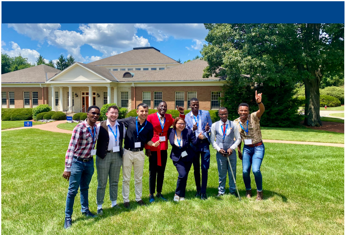
Next Generation Leaders gathering on the Kettering Foundation Campus in Dayton, Ohio for the Deliberative Democracy Exchange on July 14, 2022.