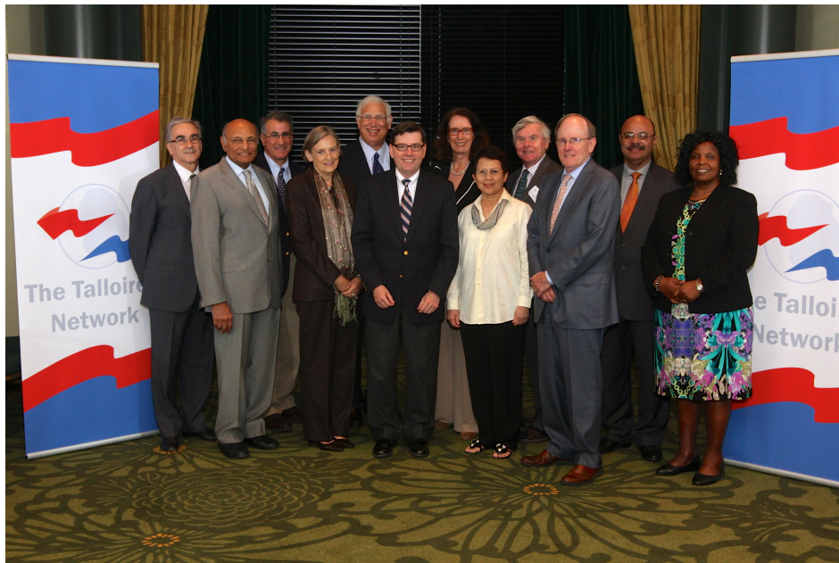
Members of the Talloires Network Steering Committee in New York City, July 2013