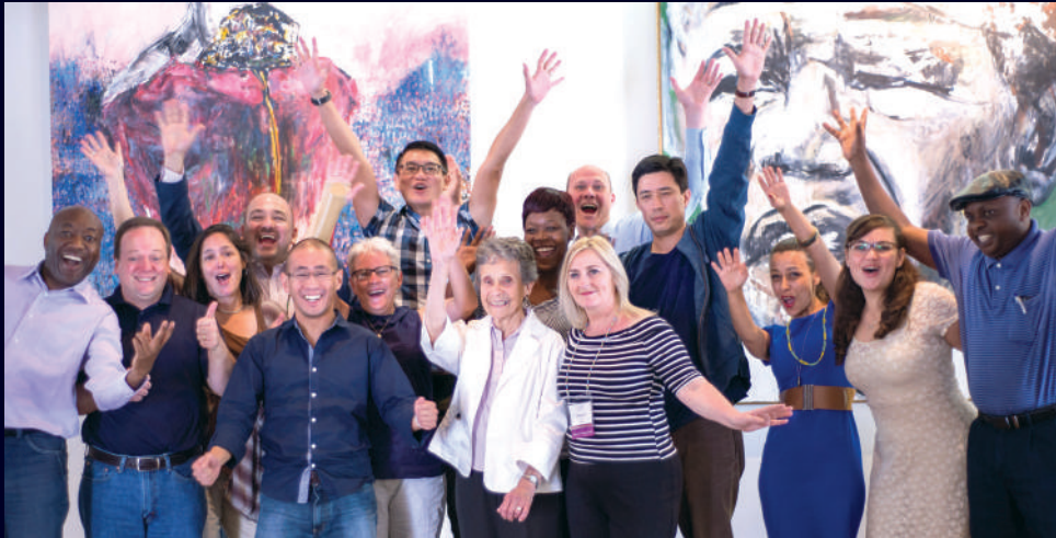
Participants in the Regional Perspectives on University Civic Engagement program